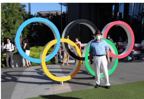
Olympic Symbol Monument

We had managed almost perfectly Olympic and follow on Vaccine program under very fragile environment. with the serious straight forward attitude of Suga X-Premier of Japan, who decided not to join the next candidate of election for next term but dedicated for Corona management. We shall have him some other time, I think.