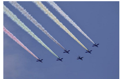
Blue Impulse at Tokyo Olympics